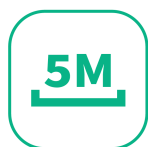
5m Pick-up Range