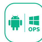
Android or Windows