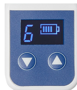
LCD indicates battery charge level and aspirate / dispense speed settings