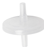
.45 \mu m and .22 \mu m filters