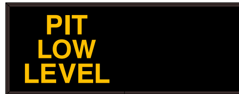
Sample Display Options