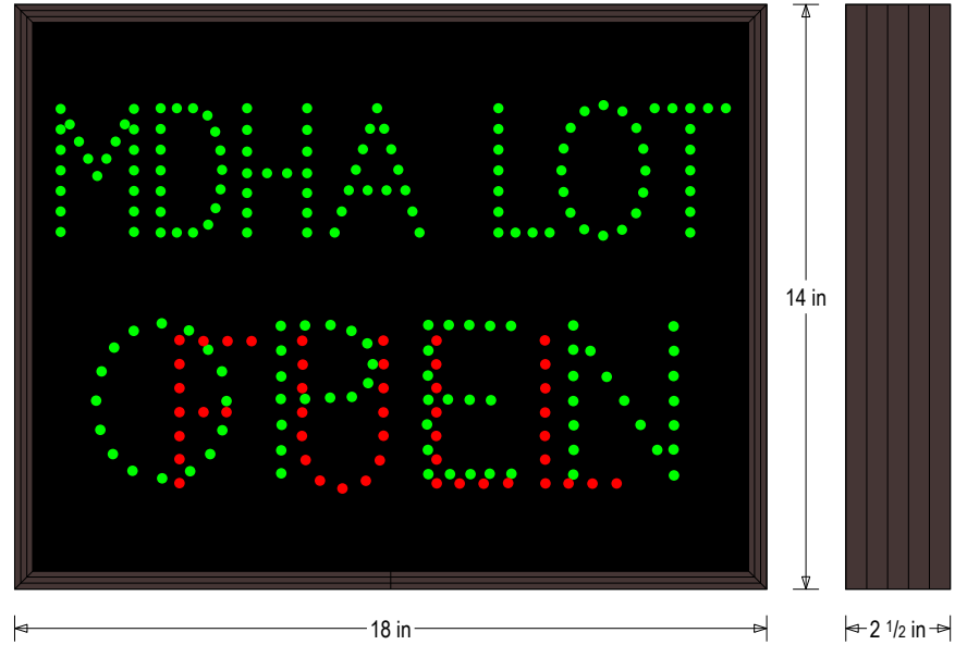
Sample Display Options

NOTE: Sign image may not exactly represent the finished product. For illustration purposes only.