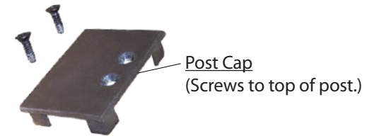
Post Cap (Screws to top of post.)