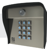
26-1000 Post Mount