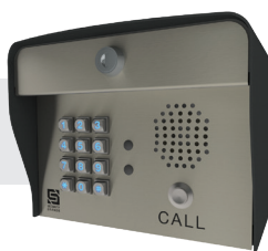
26-1000I Post Mount w/ Intercom