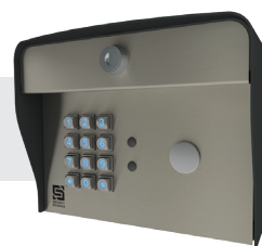
26-1000K Post Mount w/ Knox Cutout

For more information, visit us online: securitybrandsinc.com