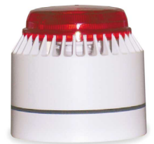
Horn/Strobe ITEM #: 42002