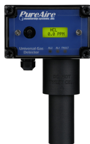
Universal Gas Detector ITEM #: 99030