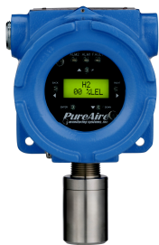
MPS Flammable Gas Monitor