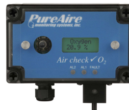
Oxygen Deficiency Monitor ITEM #: 99016