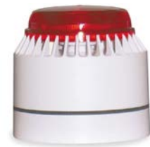
Red Horn/Strobe 24VDC