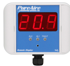
Remote Digital Display