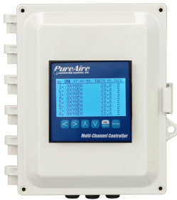
8 Channel Programmable Controller for O 2 or Gas Monitors