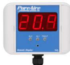
Remote Digital Display