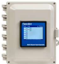
8 Channel Touch Screen Programmable Controller