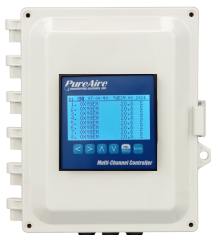
8 Channel Programmable Controller for O2 or Gas Monitors