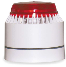
Red Horn/Strobe 24VDC