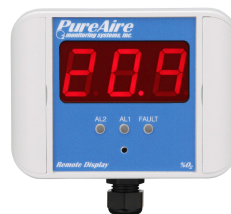
Remote Digital Display