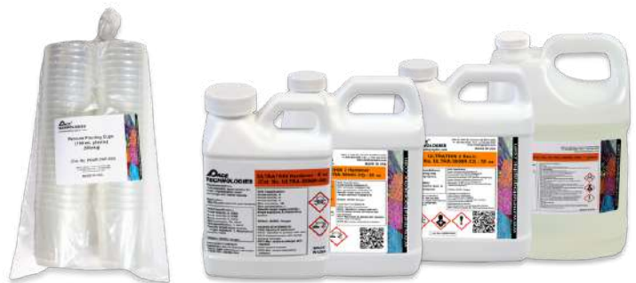
Vacuum Impregnator Pouring cups