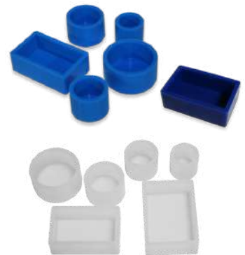
Silicon Rubber Molds