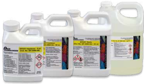
Standard Epoxy Cure