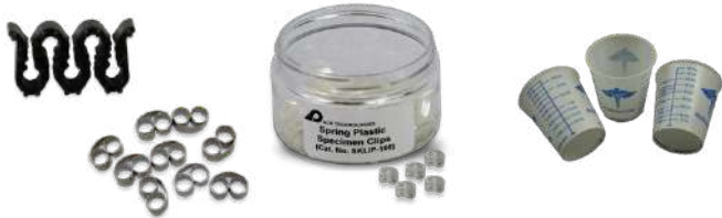
Specimen Mounting Clips