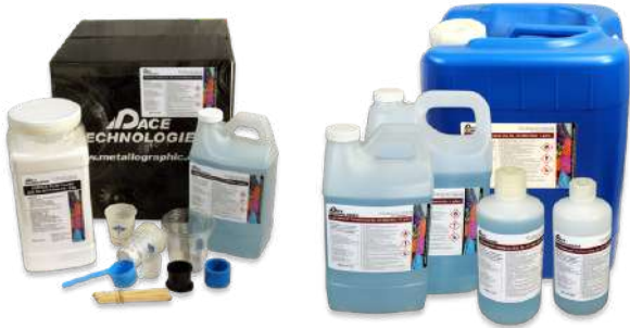
CASTAMOUNT Acrylic kit

Castable acrylics are easy to use and are very robust. The main advantage of mounting with castable acrylics is the fast curing time. Depending upon the mixing ratio, castable acrylic mounts are typically ready to use within 8-15 minutes. Also unlike epoxy resins, the ratio of the various acrylic parts (powder to liquid) can be altered up to 25% with no adverse effects to the final properties of the mount. This is because both the liquid and powder are acrylics containing various additives and curing agents. By varying the ratio of the liquid to powder, the curing time and viscosity can be altered.