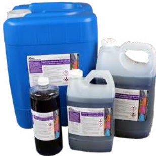
MAXCUT Abrasive cutting fluid