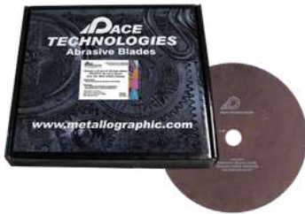
10-inch MAX-A250 Abrasive Blade