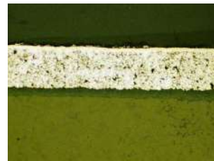
Aluminum nitride coated ceramic, 400X, Brightfield