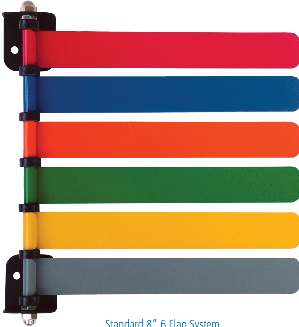
Standard 8" 6 Flag System #291706

Improve business efficiency • Improve employee workplace safety • Improve patient care & management