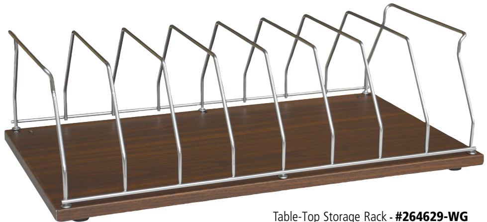
Table-Top Storage Rack - #264629-WG