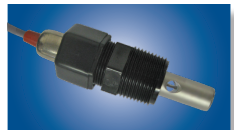
Assembled CS910 Sensor

measurements for superior temperature compensation 2 .