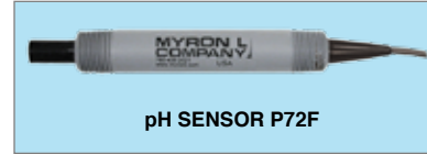
pH SENSOR P72F

Several choices of sensors are available, in 1/2" MNPT or 3/4" MNPT, depending on the demands of the application. The basic pH sensor utilizes the standard round glass electrode with a single reference junction. The basic ORP sensor utilizes a Platinum electrode with a single reference junction. See 720II Sensor Selection Guide for additional information.