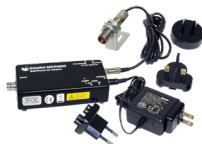
SPSR-115/230 Kit SPSR-IM, 8 ft. ROS-P, & Universal Recharger

The SPSR-IM Self-Powered Sensor Interface Module is a self-contained, rechargeable battery powered device for developing a TTL compatible one pulse per revolution output for triggering external equipment such as vibration analyzers, spectrum analyzers, stroboscopes, data acquisition equipment, tachometers, balancers, waveform analyzers and magnetic tape recorders.