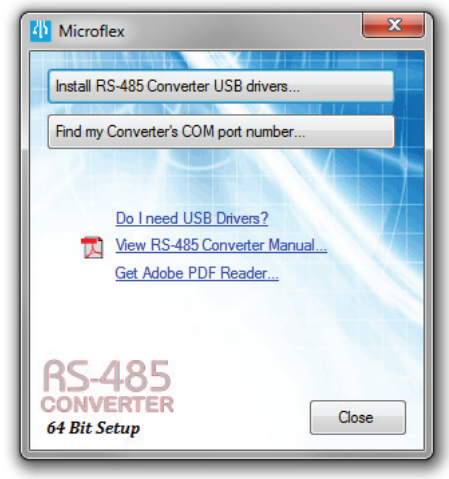
RS-485 Convert Setup Utility