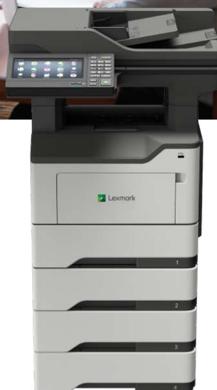
MX622adhe with optional trays