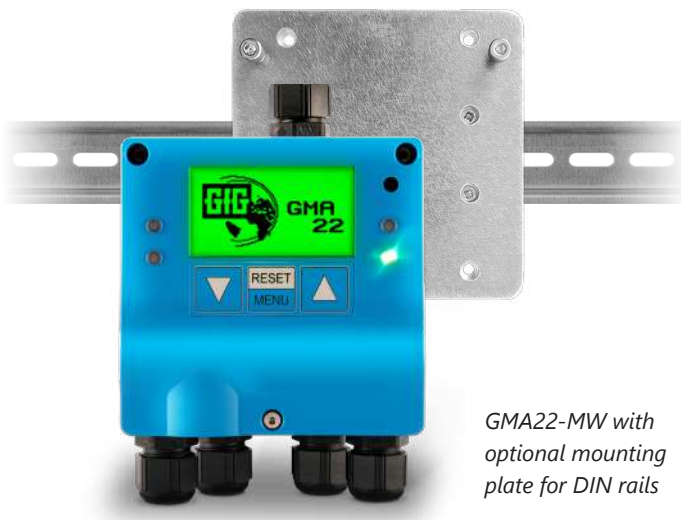
GMA22-MW with optional mounting plate for DIN rails

Even more flexibility is available with the option to address not only the transmitters but also up to 4 additional relay modules from the GMA200-RT or GMA200-RTD through the digital RS-485 interface.