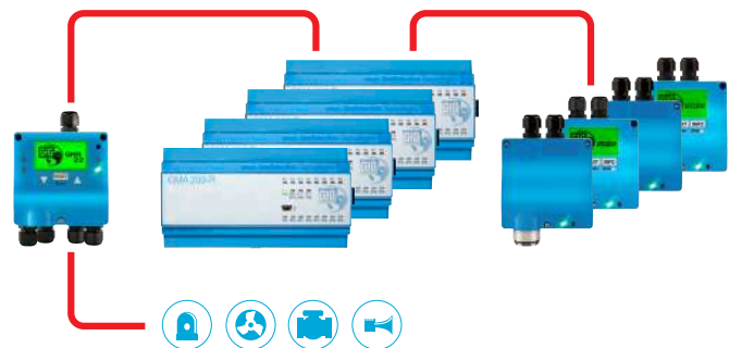
GMA22-MW maximum configuration

ACDC (Analog Carrier for Digital Communication) is a patented technology from GfG. It allows an analog transmitter to communicate with a controller using a 4-20 mA line in the same way that a digital transmitter uses a bus connection to communicate. For example, this allows for remote calibration of an analog transmitter. However, it requires that both devices are ACDC-capable.