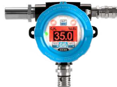
CC33 with lacquered aluminium housing and explosion-proof buzzer

Also, in combination with GfG's powerful controllers, the CC33 is the right choice for monitoring flammable gases and vapors up to the lower explosion limit (LEL) as well as ammonia (% volume).