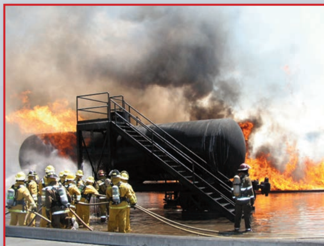
Fire fighting operations