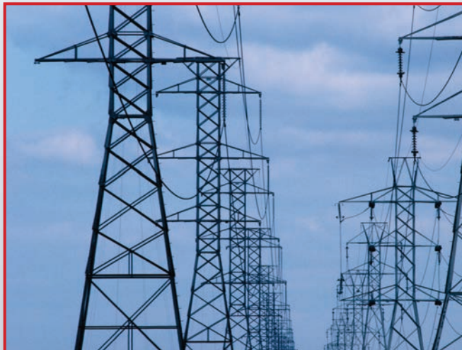
Power generation and transmission, and maintenance

Hard Plastic Protective Case, User's Manual, 1 Year Limited Warranty