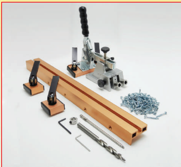
Professional Face Frame Jig System X1 - #8561