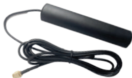
External Wi-Fi Antenna