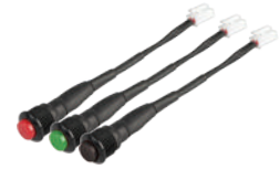
Push Button Screen View Controls

www.firereseach.com +631.724.8888 sales@firereseach.com