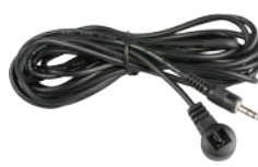
External IR Sensor