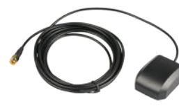
External GPS Receiver