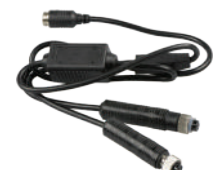
Standard Definition Splitter Cable (If Needed)