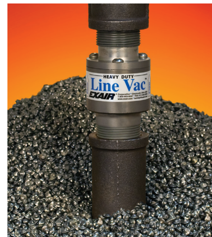
The hardened alloy construction of the Heavy Duty Threaded Line Vac resists wear when conveying abrasive steel shot.

Horizontal conveying tested at 80 PSIG (5.5 BAR)