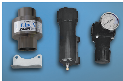
Heavy Duty Line Vac Kits include a Heavy Duty Line Vac, mounting bracket, filter separator and pressure regulator (with coupler).