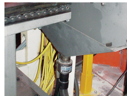
Metal parts are conveyed with the Model 150200 2" (51mm) Heavy Duty Line Vac as they drop off the edge of the conveyor.