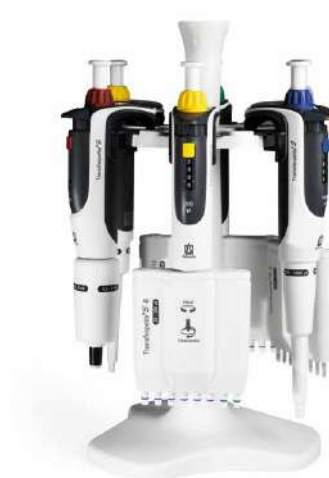
Bench top rack for 6 Transferpette® S single- or multi-channel pipettes.