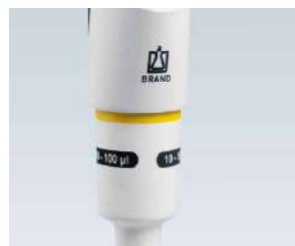
Integrated shaft coupling