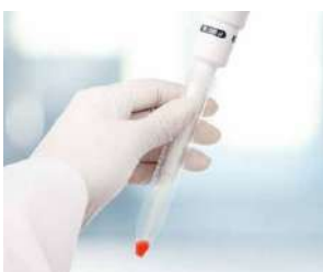
Narrow centrifuge tubes

Individual nose cones and seals can be easily removed for cleaning or replacement