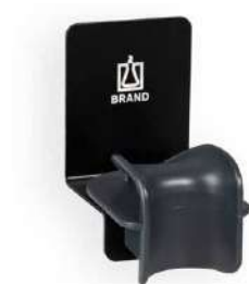
Wall mount for 1 Transferpette® S single- or multi-channel pipette.