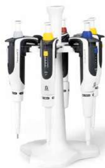
Pipette Package 2