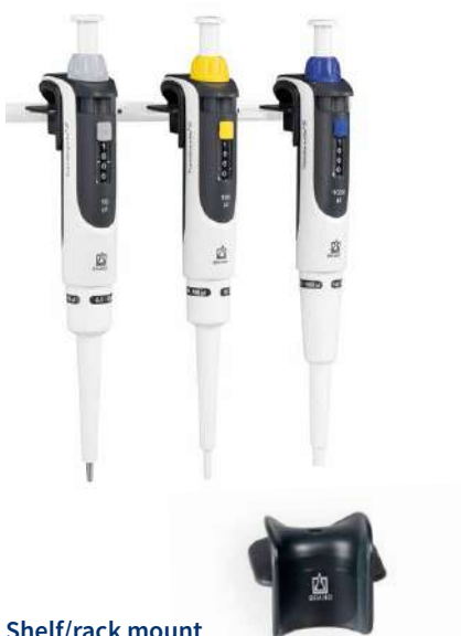
Shelf/rack mount for 1 Transferpette® S single- or multi-channel pipette.

With holders and stands, the devices are always properly stored and close at hand for the next application.