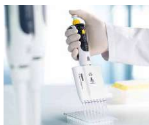
Working with PCR plates