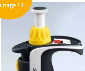
Easy Calibration technology