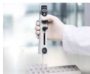
Dispensing small volumes