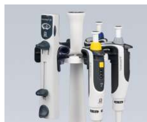
The rack mount also fits the Transferpette® S bench-top rack.