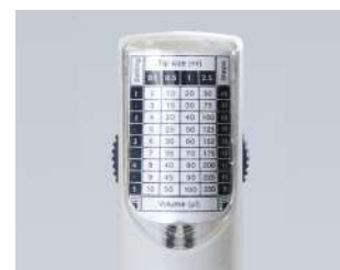
Fast volume selection with the volume table on the back side